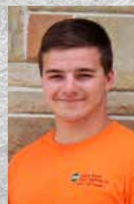
Apprentice Hunter Flinger